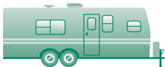
Conventional Travel Trailers