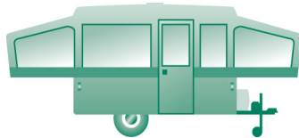
Folding Camping Trailers

Designed to be towed by family car, van or pickup truck. Can be unhitched and left at the campsite while you explore in your auto.