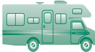
Type C Motorhomes