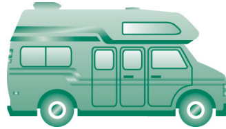
Type B Motorhomes