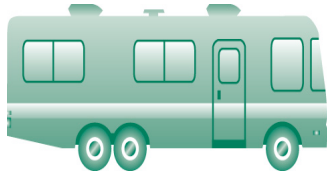
Type A Motorhomes

Living quarters are accessible from the driver's area in one convenient unit.