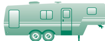
Fifth-Wheel Travel Trailers